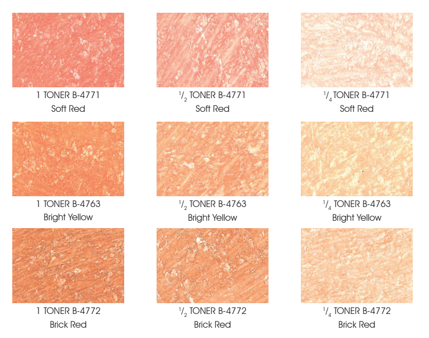
*Due to technical reasons connected with ink-printing and color reproduction, swatches shown here may differ from the exact paint color. Always refer to actual paint color standards to confirm your color. Differences in applicator and color mixing may also affect the outcome of the applied paint.

4. Wait for 8-10 minutes after applying BOYSEN DECORe. Then, lightly comb the surface using the plastic scraper with long crisscrossing strokes, the scraper inclined and close to the surface.